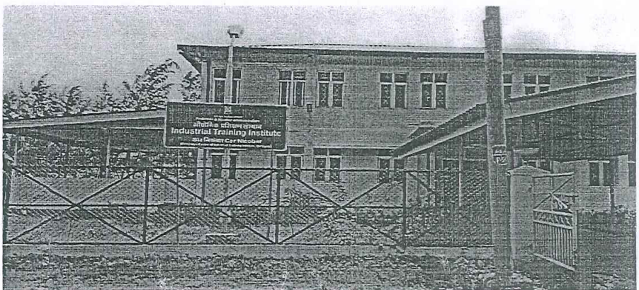
VOCATIONAL TRAINING CENTRE AT BIG LAPATHY

I would like to bring to your attention that the people residing in these places are deprived of daily water supply and does not have the facilities of drinking water also. The Health sector needs serious attention. In view of the above construction of these buildings is a CRIMINAL WASTAGE OF MONEY ,