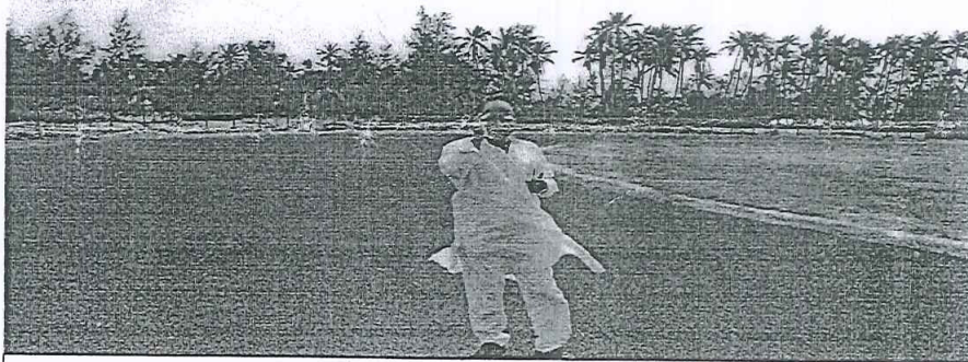
SYNTHETIC ATHLETIC TRACK AT MODERN SPORTS COMPLEX, CAR NICOBAR