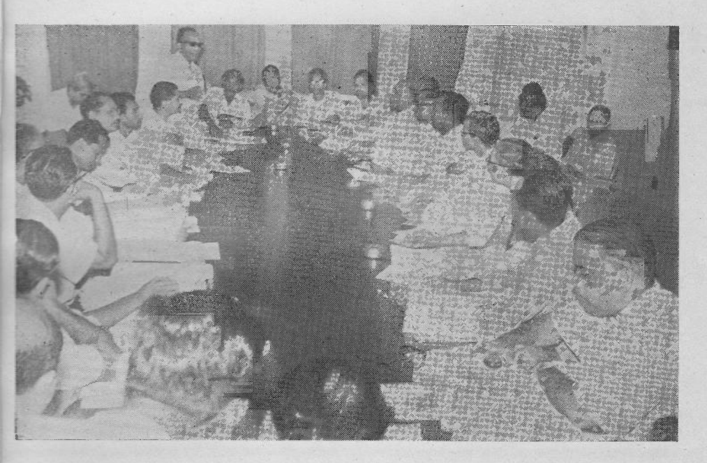
First meeting of the Reconstituted Tribes Advisory Council