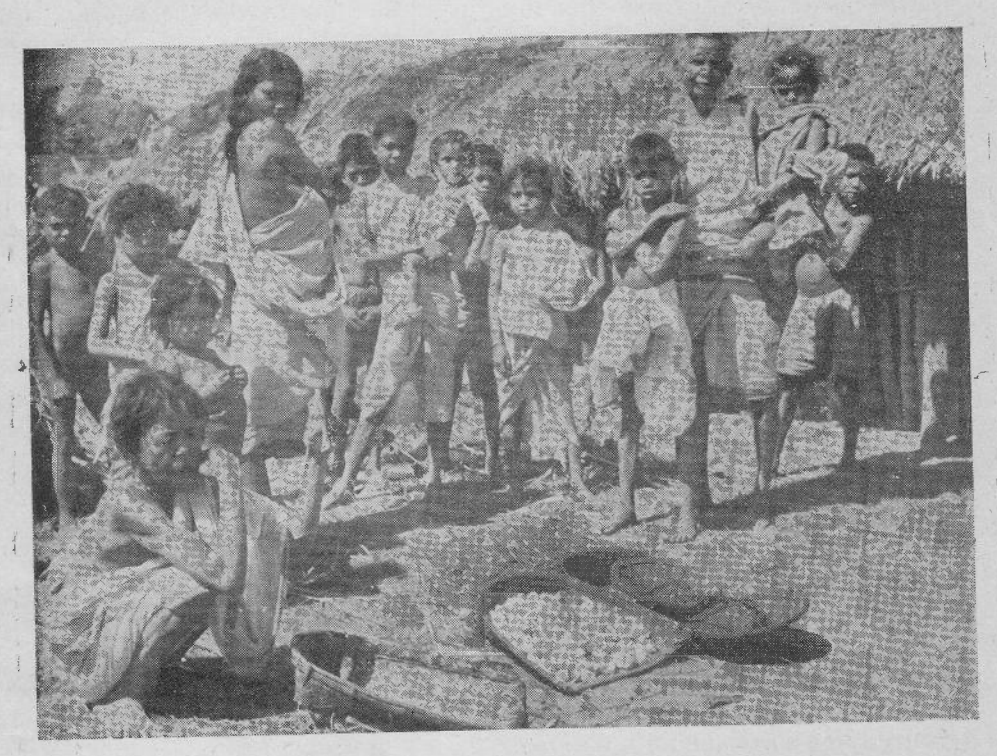
A group of Kharia women with the Satisfood (Palua) collections