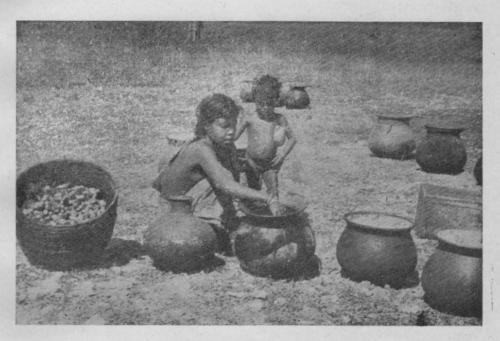
Kharia woman making Satifood (Palua) from tubers