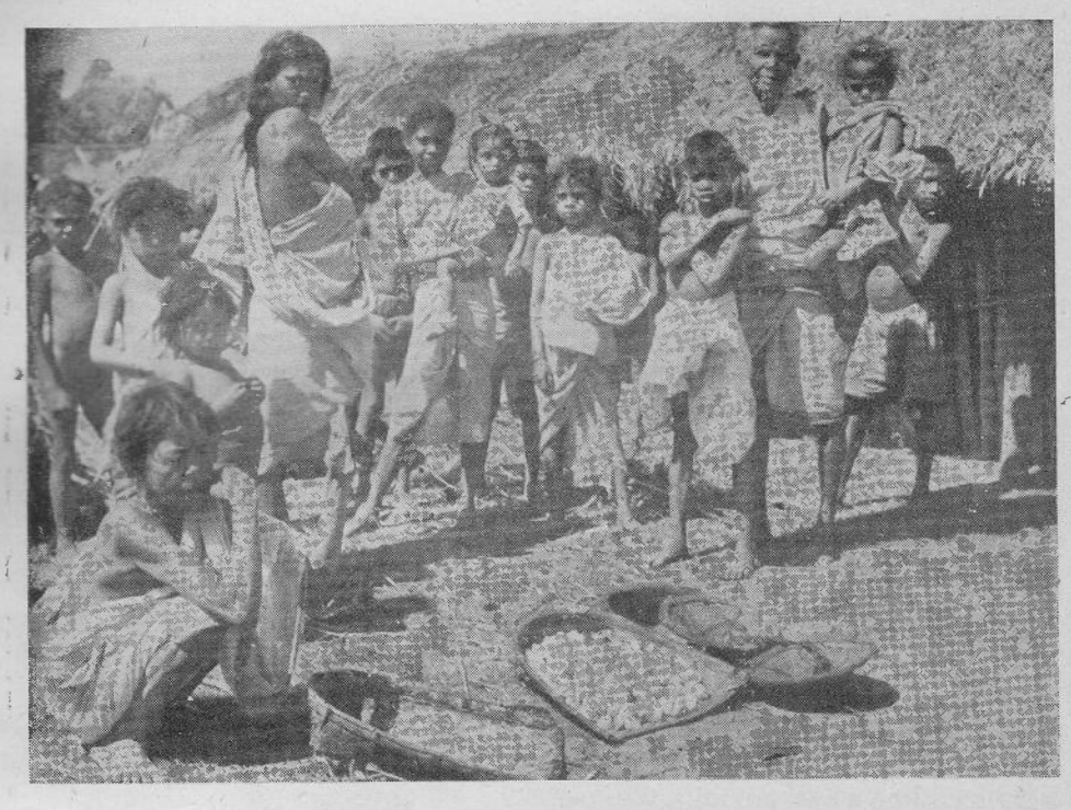
A group of Kharia women with the Satifood (Palua) collections