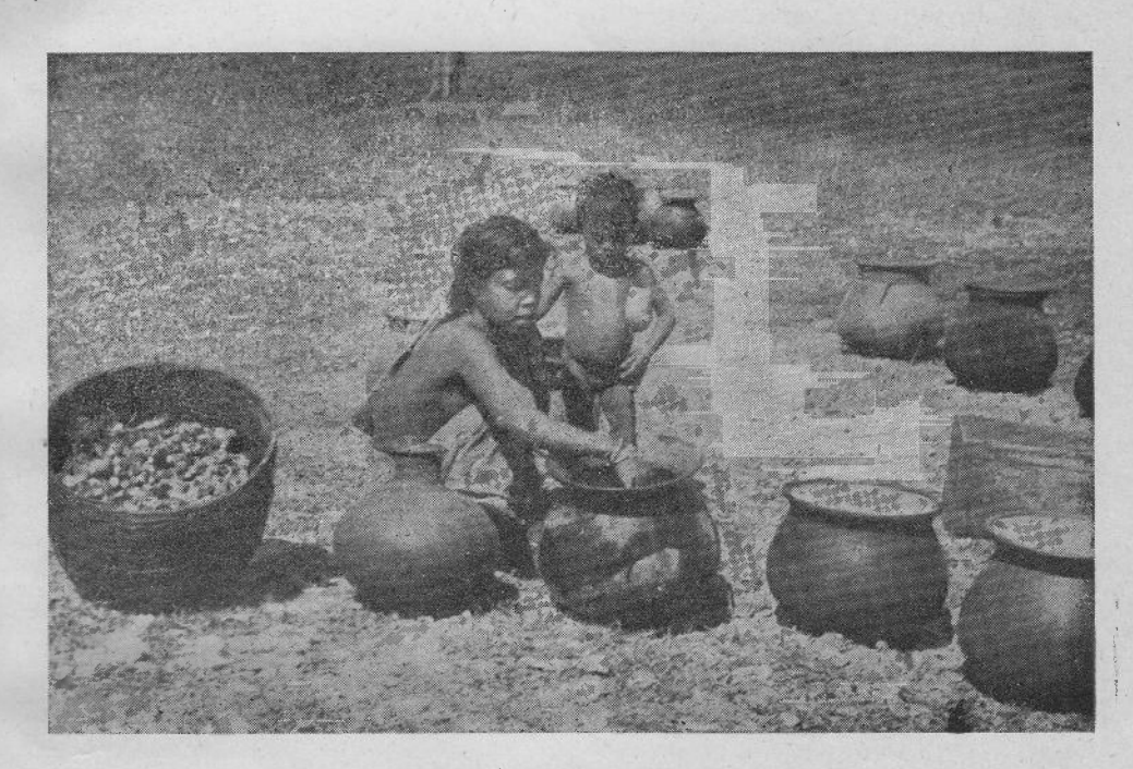
Kharia woman making Satifood (Palua) from tubers