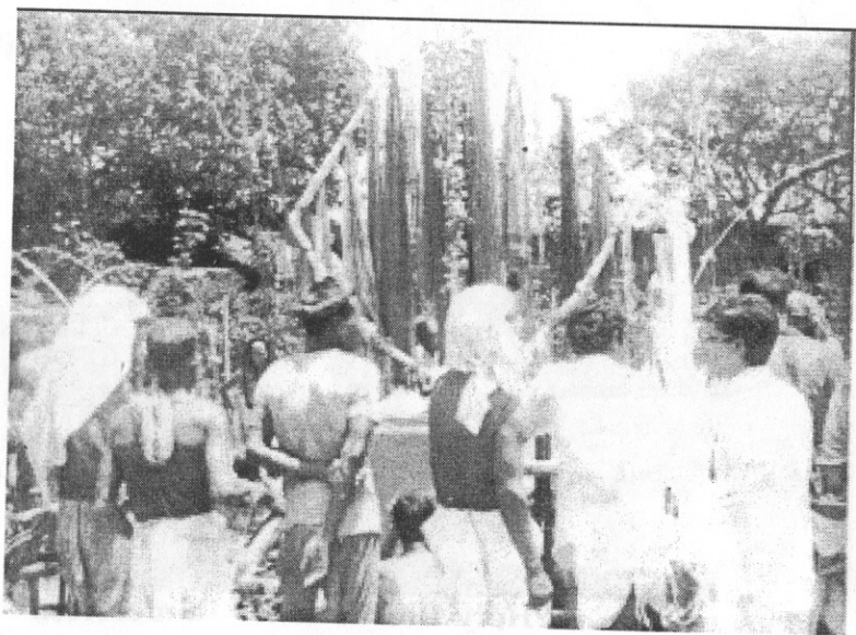
Rituals in Garia Puja.