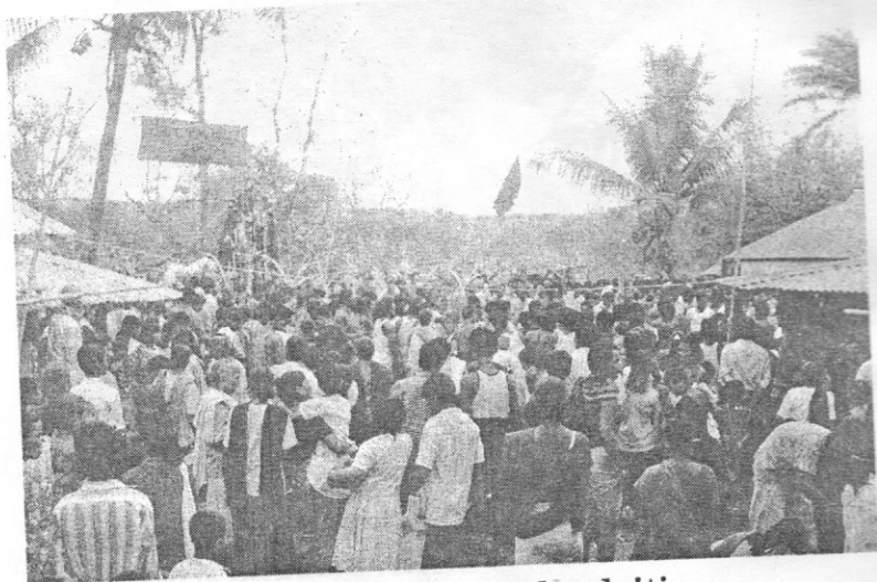
A gathering before the deities.