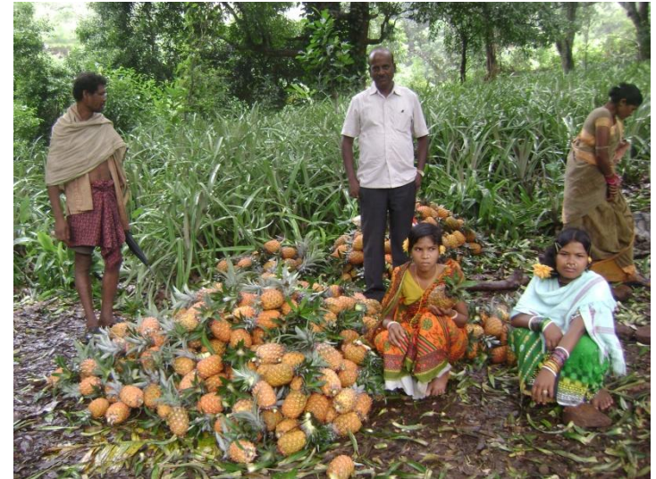
Pineapple Cultivation by DangriaKandha of Khambesi Village

Under CCD interventions of DKDA, Kurli, Rayagada Micro Project pineapple cultivations have been taken up in 21 DangriaKandha villages in an extent of 150 acres of land during 2012-13 and 2013-14. As many as 300 beneficiaries have covered under this scheme. The estimated cost of the project was Rs.15,00,000/- only. Since it is a very profitable programme the Micro Project staff motivated the DangriaKandha people by approaching them frequently in their villages. Now with the help of beneficiaries the agency has been able to implement the scheme successfully and the DangriaKandha people