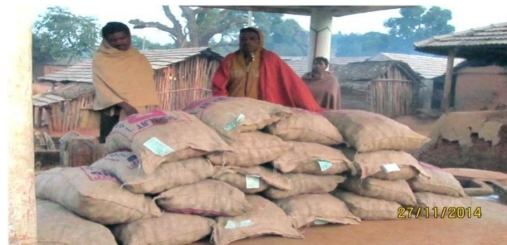
DISTRIBUTION OF POTATO SEEDS

During 2014-15 JDA implemented Potato Cultivation in 28 villages. We Supplied 250 Quintals of potato seeds to 1632 beneficiaries. It yielded total Production of 800 tons. It increased their income substantially. The villages covered under potato cultivation are Upperchempi, Bayakumuntia, Gadgadi, Mamalaposi, Budhighar, Upperbali, Talabali, Kaptadiha, Nadam, Saria, Hatisila, Talaraidiha, Dumuria, Talabaruda, Toranipani, Talasumatha, Duarsuni, Hungi, Kundhei, Kadalibadi, Upperbaitrani, Upperraidiha, Talapada, Gonasika, Guptaganga, Kanipani, Rimulighati, Upperpanasana. The outcome of this programme led to their economic up-liftment as well as provide food security and nutrition.