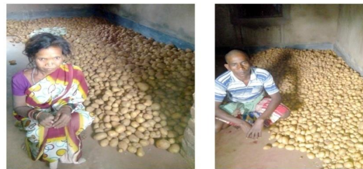
PRODUCTION OF POTATO