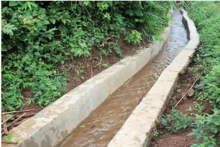
Construction of Culvert at Kinari Under Bilamala G.P.