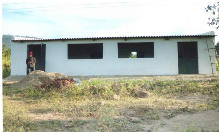
Construction of Community Cowshed at Village Rangaparu under Belghar G.P.