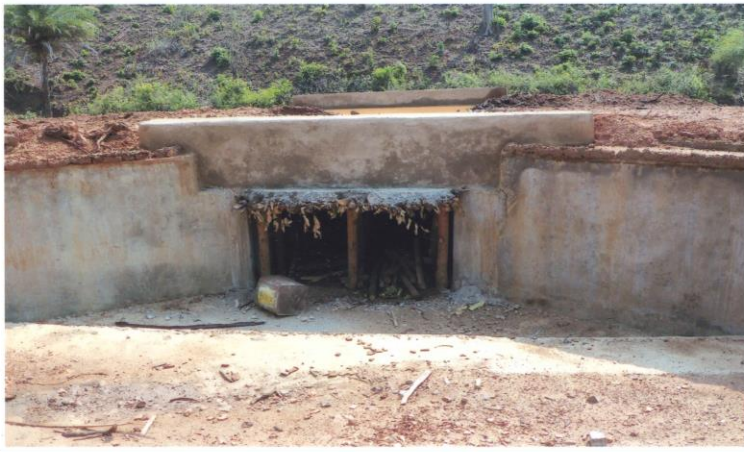
Construction of Culvert at Kinari Under Bilamala G.P.