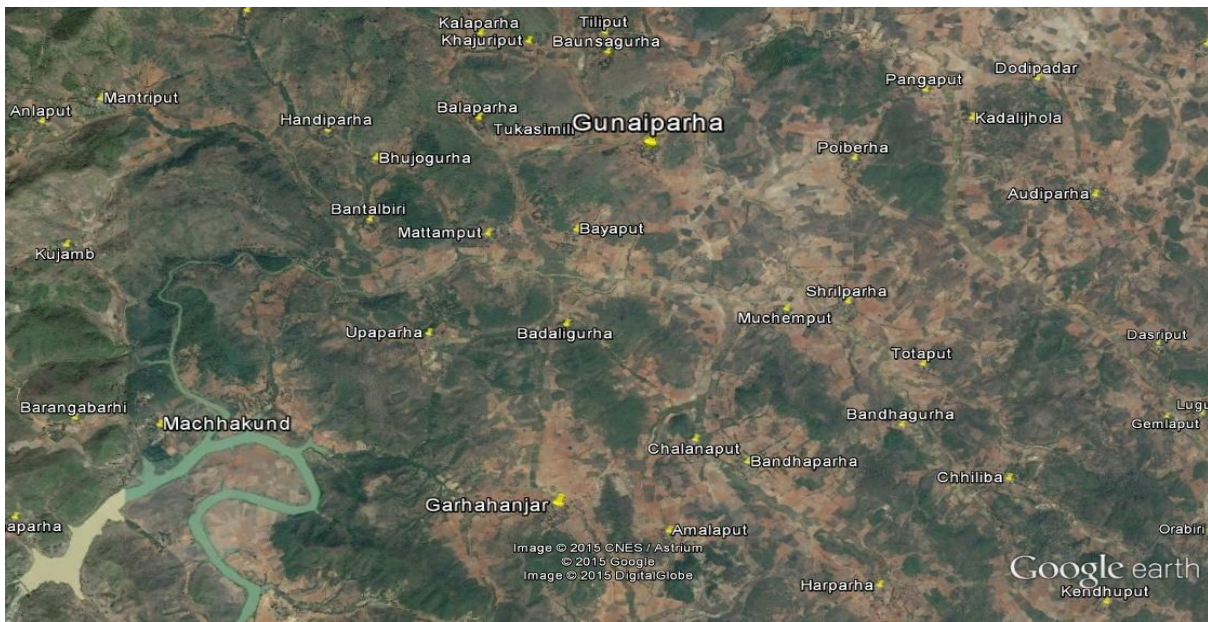
Google Earth imagery of Gadaba villages in Guneipada GP

The Gadaba community in Lamtaput block is mainly concentrated in Jalahanjar, Guneipada, Chikenput and Godihanjar Gram Panchayats. However, the Gadaba households are found in larger numbers in a contiguous patch in the Jalahanjar and Guneipada GPs. Both the Gram Panchayats are relatively remote and can be approached from district headquarters Koraput via Semiliguda or Jeypore. While Jalahanjar GP headquarters is about 6 Km from Lamtaput, Guneipada is about 10 km. The Gadaba villages are found scattered in these two GPs. The area is highly sensitive for presence of Left Wing Extremists.