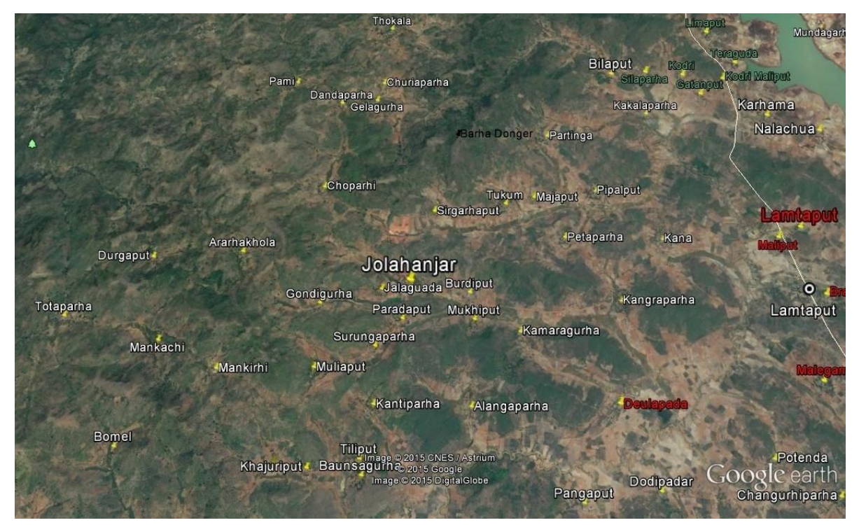
Google imagery of location of Gadaba villages in Jalahanjar GP